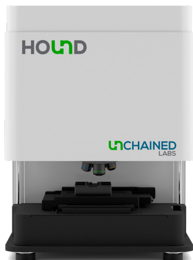
Figure 3: Hound combines microscopy, Raman and Laser-Induced Breakdown Spectroscopy (LIBS) to count, size, and ID particles by their chemical or elemental fingerprints.

PSD methods that rely solely on size and shape may provide insufficient data to properly characterize an API in a mixture. The Hound (Figure 3) first uses bright- or dark-field imaging to automatically characterize each particle within the sample for size, shape, morphology, and fibrosity. Next, Hound uses Raman spectroscopy at 785 nm or 532 nm to capture the chemical signature of the particles and identifies them by comparing them to a built-in customizable database. The combination of the two techniques ensures that PSD can be performed on complex samples quickly, with an orthogonal analysis method to confirm identity.